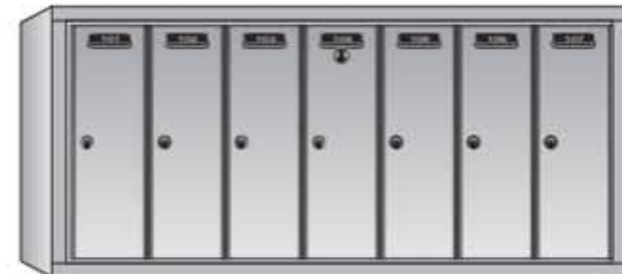
SURFACEMOUNT - MODEL 1000-7