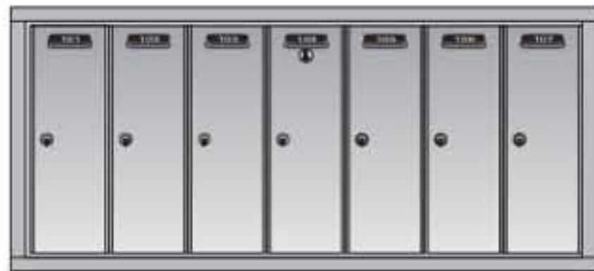
RECESSED - MODEL 1000-7