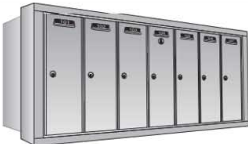
SEMI-RECESSED - MODEL 1000-7