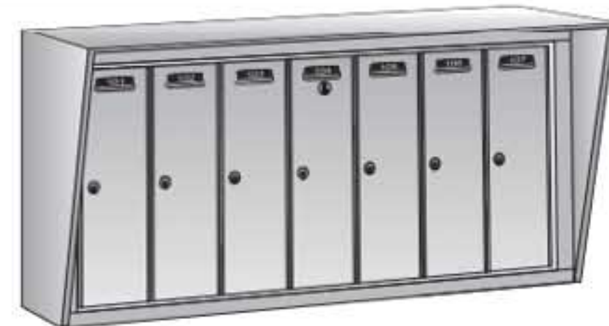
WALLMOUNT - MODEL 1240-7

WE MAKE BUYING MAILBOXES A PROBLEM FREE EXPERIENCE