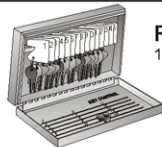
R130-15 15 KEY CAPACITY

UNEQUALLED EXPERTISE IN MAILBOXES + POSTAL SPECIALTIES